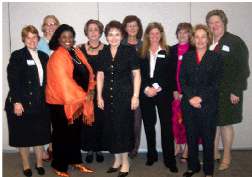
EEH Board of Directors: