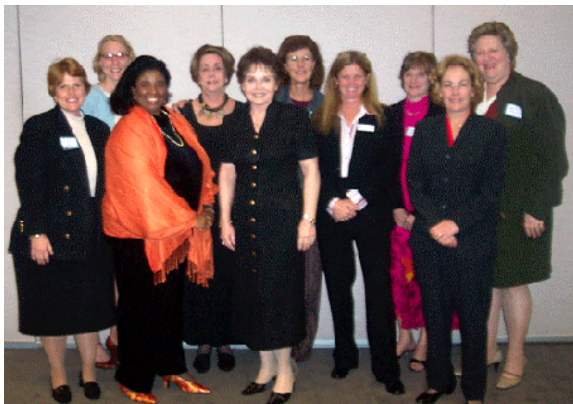
EEH Board of Directors: