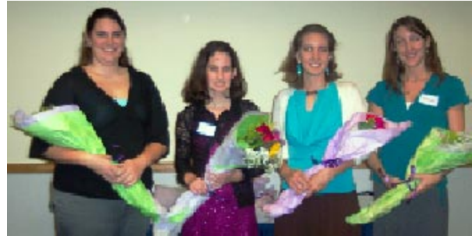
EEH Scholarship Recipients: